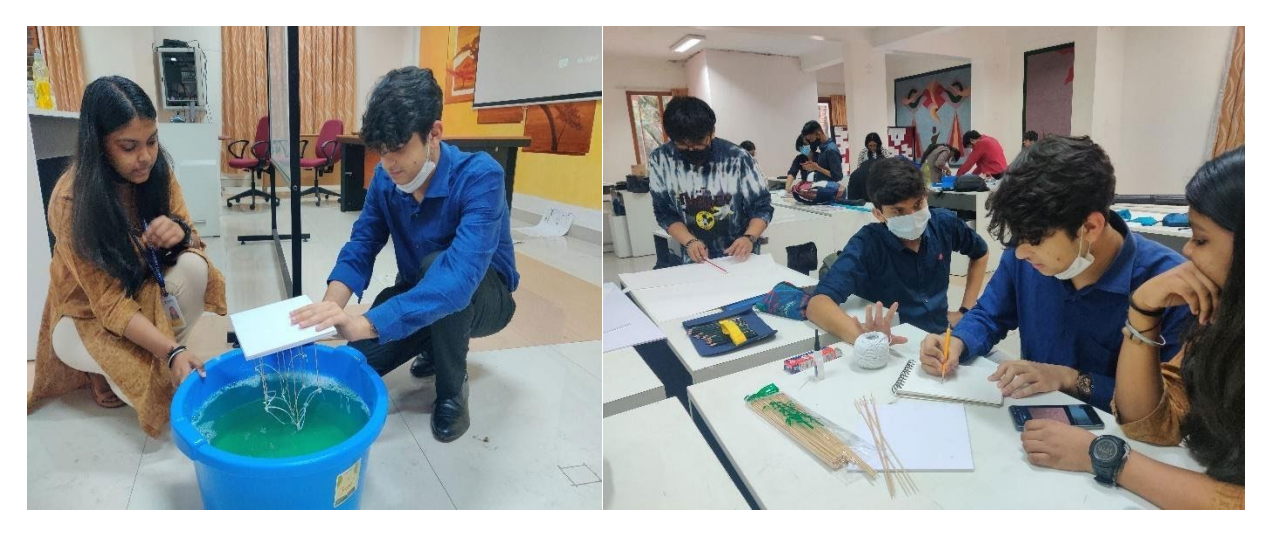
Fig 1-Learning to design tensile structures via model making and experimentation. Fig2 - Model making workshop during Discovering Design Studios.